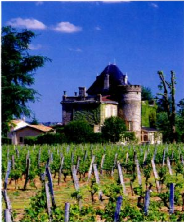
Above: Château du Seuil, among Graves' top white names